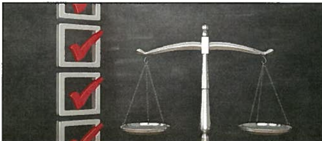
Fact-Finding when Facts are Disputed

“Any rules adopted by a recipient regarding issues of relevance should be reflected in the recipient’s training materials.” 85 FR 30294