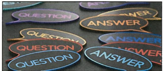
The Questioning Phase