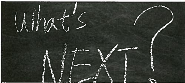
After the Decision